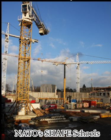
NATO's SHAPE Schools