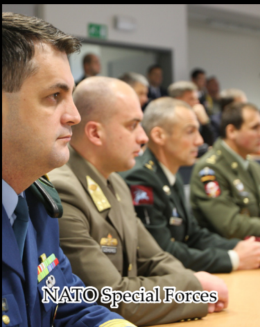
NATO Special Forces