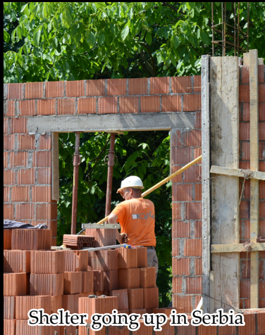
Shelter going up in Serbia