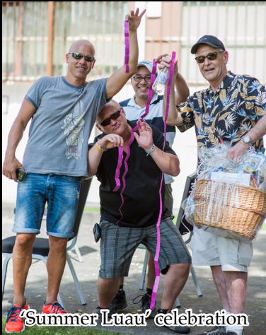
'Summer Luau' celebration