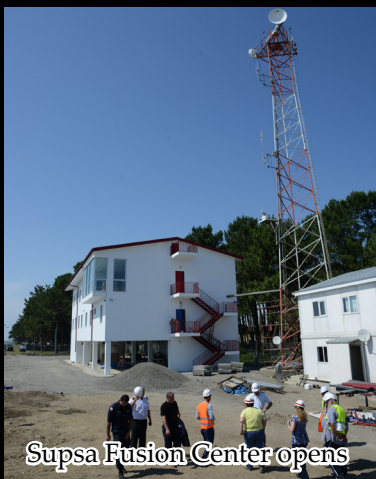
Supsa Fusion Center opens