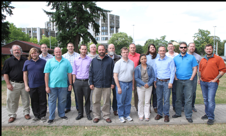
The Information Management Office in Wiesbaden, Germany, is a mix of civilians, local nationals and contract employees working together with a focus on mission support and customer service throughout Europe District.

The Information Management Office provides information-technology support to personnel at Europe District headquarters in the Amelia Earhart Center and the district's 30 field locations across nine countries.