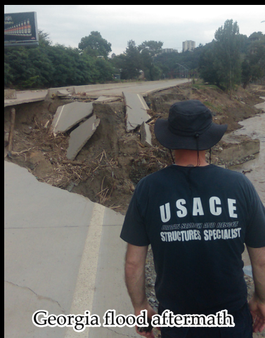
Georgia flood aftermath