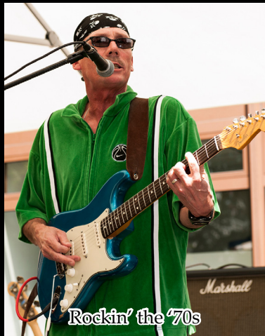
Rockin' the '70s