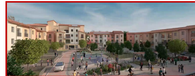
Family Housing, Italy