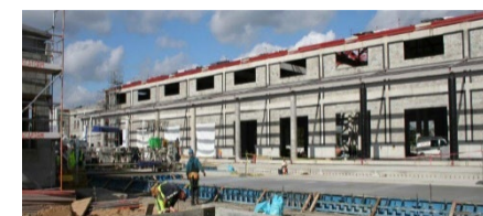
LTESM-C Vehicle Maintenance