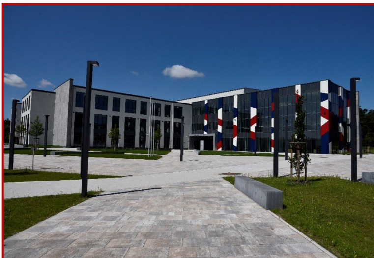
Ramstein High School, Germany