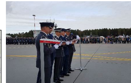
Runaway Ribbon Cutting task, Poland