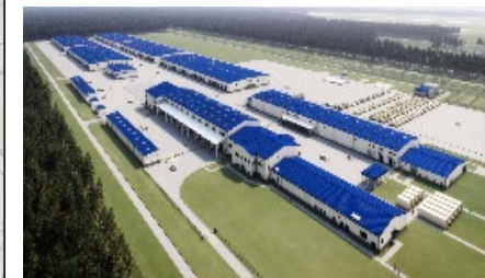
NATO Long Term Equipment Storage and Maintenance Complex (LTESM-C), Powidz, Poland