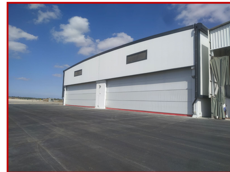
Flight Training Center, Israel