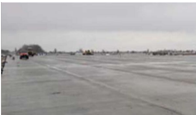
Arm/Disarm Pad, Graf Ignatievo, Bulgaria