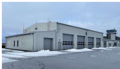
Fire Station, Lielvarde, Latvia