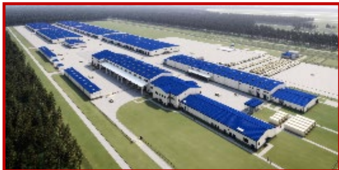
NATO Equipment and Storage Complex, Poland