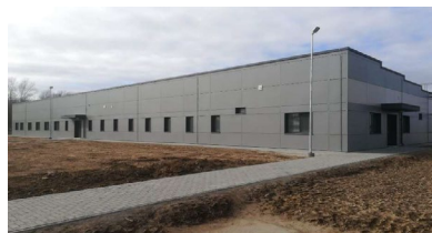
Squadron Ops Facility Upgrades, Lithuania