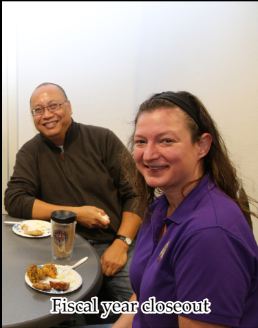
Fiscal year closeout