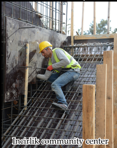
Incielik community center