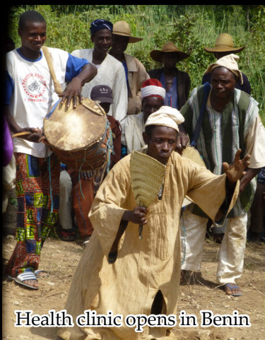
Health clinic opens in Benin