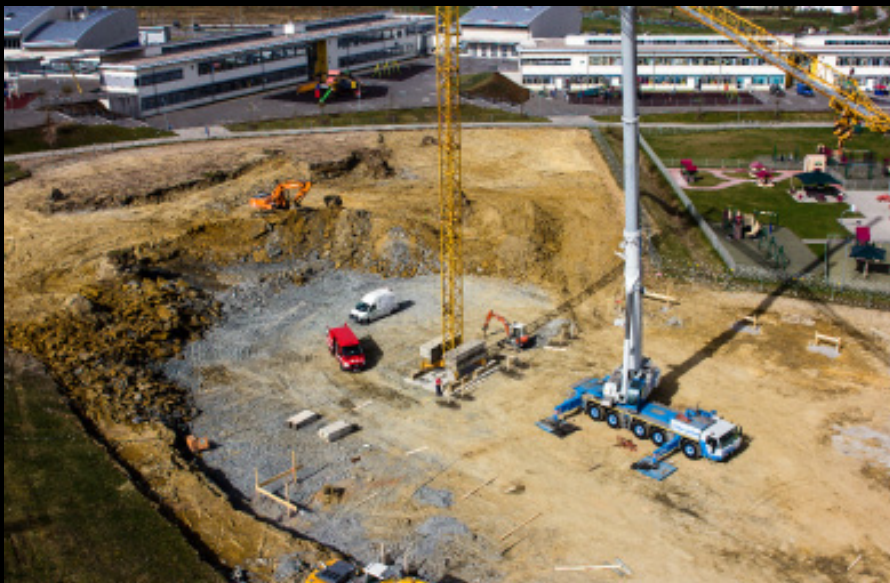
Site preparation continues for the future Netzaberg Chapel at U.S. Army Garrison Bavaria in Germany, the final project under Efficient Basing Grafenwöhr. The 600-person facility will include an activity center, kitchen, religious education areas, resource center, sacristy room and administrative spaces.

The Grafenwöhr Resident Office provides engineering, construction, and environmental-management products and services to U.S. Army Garrison Bavaria in eastern Germany, including the Grafenwöhr and Rose Barracks communities.