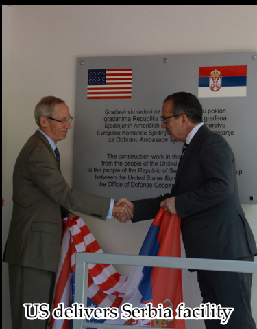
US delivers Serbia facility