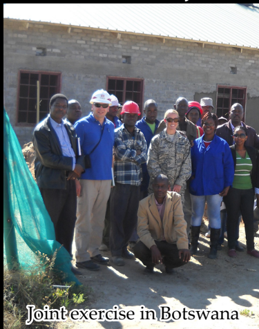
Joint exercise in Botswana