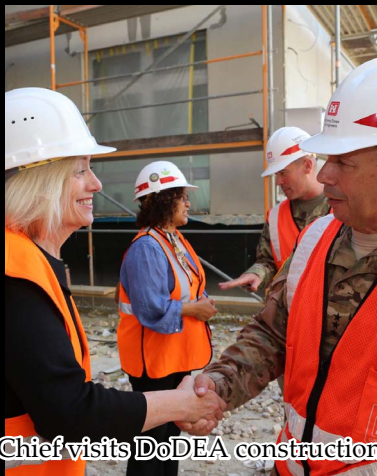
Chief visits DoDEA construction