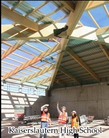
Kaiserslautern High School