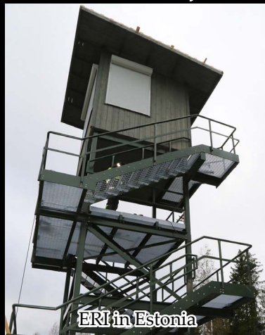
ERI in Estonia